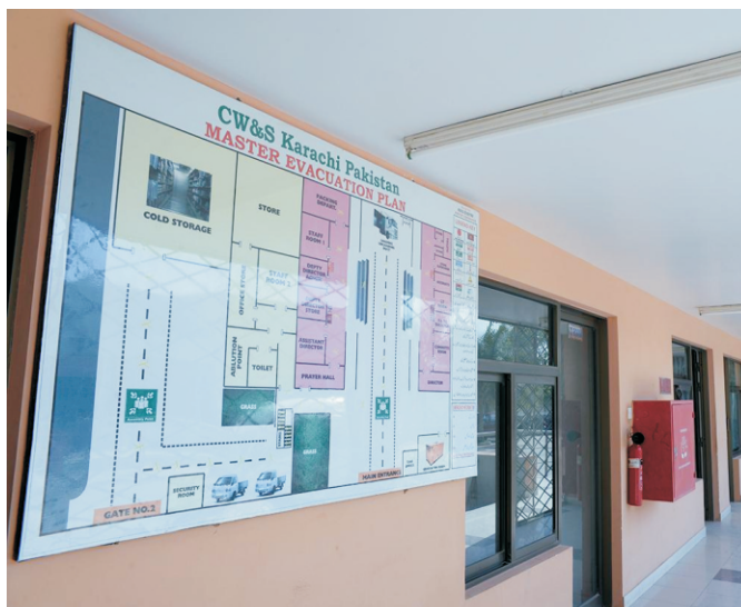
Central Warehouse and Supplies Karachi Master Evacuation Plan