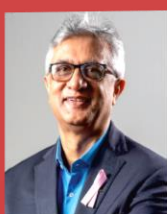
Dr Faisal Sultan Special Assistant to Prime Minister/ Federal Minister of Health

“Universal Health Coverage (UHC) is an investment not just good for the individuals who directly benefit, but also worthy for their families, communities, country’ growth and political stability.”